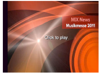
Musikmesse 2011: Neumann