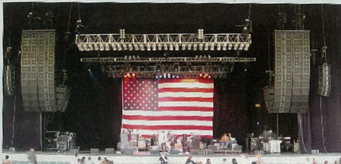
XXXX Audio prepares for a Sheryl Crow concert at the Sleep Train Pavilion in Concord, Calif.

ELKHART, Ind. — Crown's MA-12000i amps were featured in XXXX Audio System's live applications for a number of concerts,